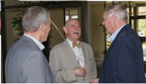
Ashland and Northern Kentucky areas." It was a beautiful day for the drive to Frankfort and the lunch, as always, was excellent.